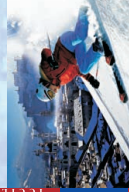
European snow cool